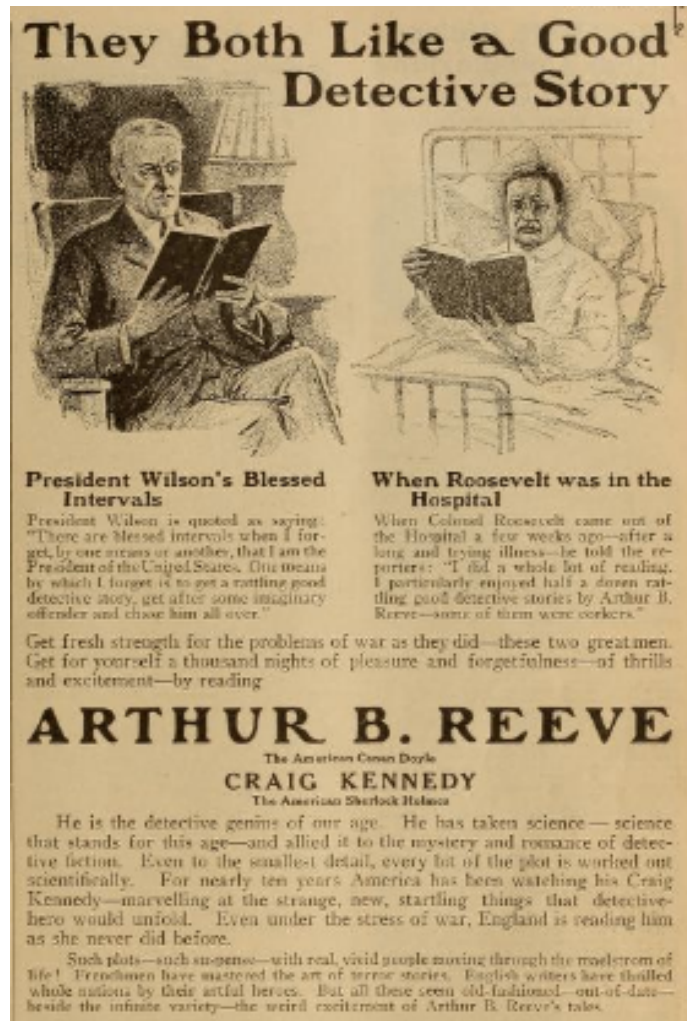
Book Ad for The American Conan Doyle - Arthur B. Reeve & The American Sherlock Holmes - Craig Kennedy