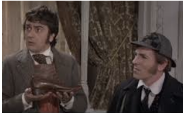
Dudley Moore and Peter Cook

You can view the trailer of this attempt at a Hound comedy at: http://www.youtube.com/watch?v=GAqhTZ08Gqg