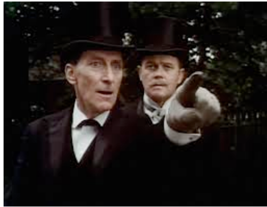
Peter Cushing & Nigel Stock

Not to be confused with the Hammer Hound film of 1959, the BBC TV Hound attempted to remain faithful to the original story.