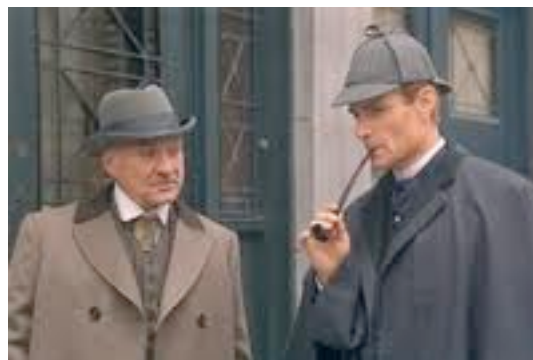
Kenneth Welsh and Matt Frewer

The first of four Holmes adaptations on Canadian TV starring Frewer as Holmes. Regretfully, Frewer's portrayal of Holmes was criticized by a number of Holmes' fans.