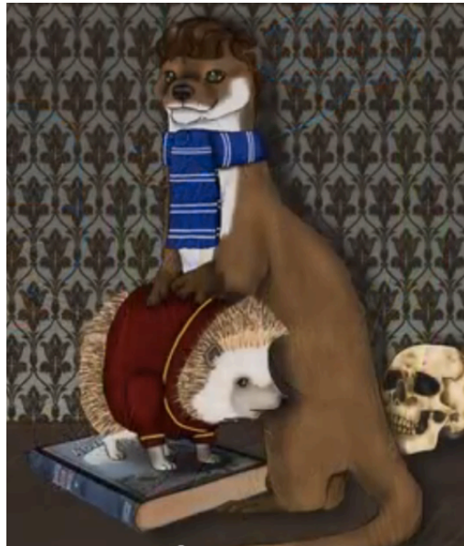
Hedgie and Otter

Do you have any OTTERs for us? Or is this essay just OTTERLY too ridiculous for you?