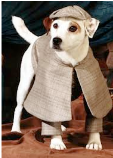
Wishbone (aka Scooter)

1996 - Wishbone returns as Sherlock Holmes in “A Dogged Exposé”. This episode was based on “A Scandal in Bohemia”.