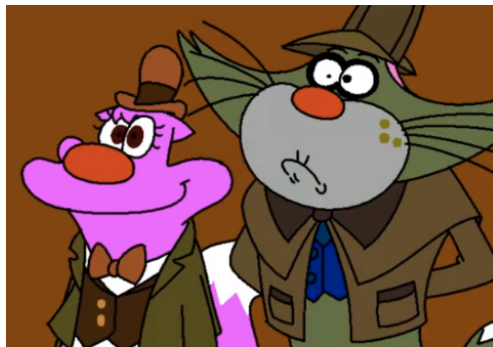
Oggy and Jack

2013 Jack the Cat , plays Sherlock Holmes, with Oggy the Cat as Watson, in the French animation four part movie “Oggy and the Cockroaches”. Part three is called “The Incredible Oggy Watson”.