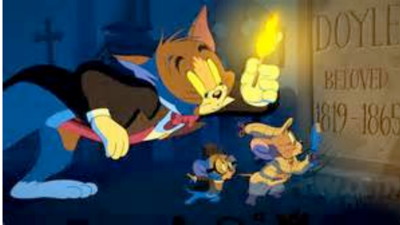
Tom and Jerry

2010 Jerry , the mouse of Tom and Jerry fame, dresses in full Sherlockian garb for the full length animated feature “Tom and Jerry Meet Sherlock Holmes”.