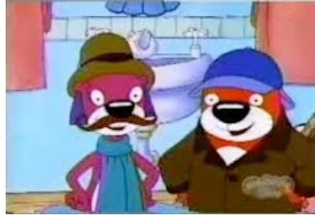
Jelly & Peanut Otter

1999 - Peanut and Jelly Otter dress in Sherlockian garb in “Sherlock Otter” the second story from the 14th episode of Season 2 and the 54th story overall of “PB & J Otter”. In this story, several objects vanish around the Otter household, so Peanut and Jelly become "Sherlock Otters" and try to solve the mysterious disappearances.” 2