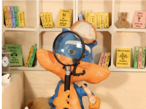
Scuffy the Cat

2013 - Scuffy the Cat plays a claymation Holmes in “Scuffy The Cat In Elementary”.