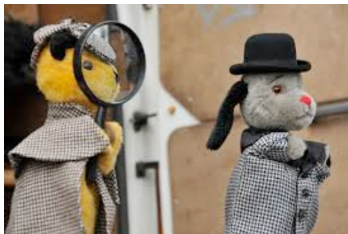
Sherlock Sooty and Dr. Wosit

1995 - Sooty a hand puppet bear, plays Sherlock Sooty, with Sweep , a hand puppet dog as Dr. Wosit , in an episode of “Sooty & Co.” U.K., titled “Sherlock Sooty Visits”.