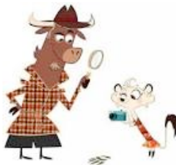
Sherlock Yack and Hermione

2011 - Sherlock Yack is the zoo's manager as well as its detective, in the series 'Sherlock Yack, Zoo-Déetective'. As soon as a crime is committed, he investigates with his young assistant, Hermione. With her help, he finds suspects, clues and proofs... while inviting the young viewer to lead the investigation and find the culprit at the same time. There were 52 episodes of approximately 13 minutes each made for MONDO TV, France. Yes a YAK!