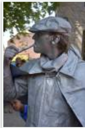
Marche-en-Famenne, Belgium - Statues En Marche Festival (2018)