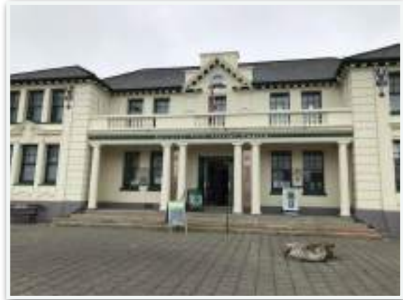
Dartmoor Visitors Centre