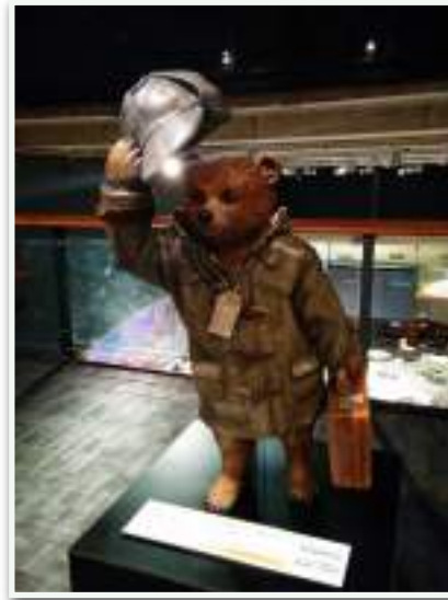
Museum of London