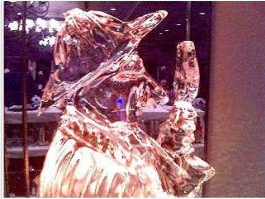
Murder Most Romantic

Murder Mystery Players, Inc. had a Sherlock Holmes ice sculpture at a special performance of "Murder Most Romantic" in Jacksonville, Florida (2009).