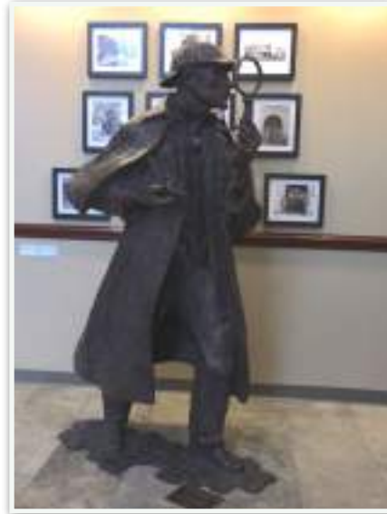
Edmond, Oklahoma, Police Station