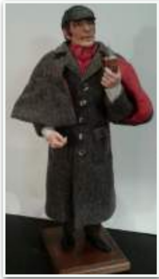
Simpich 13" Holmes figure

Of course there are numerous mass produced and/or limited edition Sherlock Holmes statues and figurines produced in all sizes and materials such as these examples below, but this essay is focused on the one of a kind artistic works. So please do not send me photos from your collection of ceramics, Royal Doultons, Funko Pops, pewter and brass figurines, etc. etc. etc.