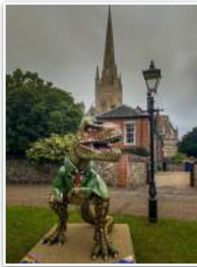
Norwich Cathedral 2021