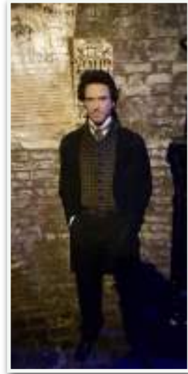
Madame Tussauds, London