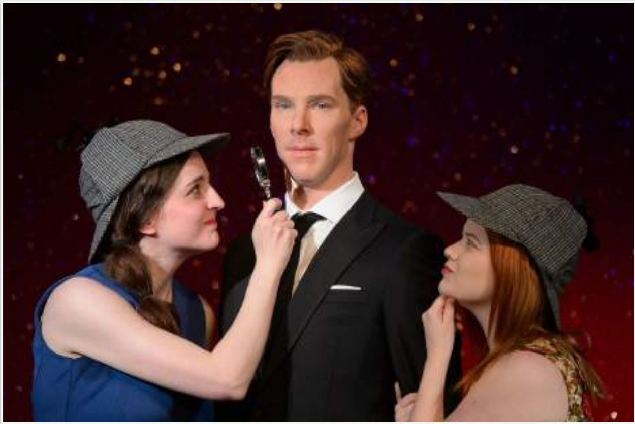
Madame Tussauds, London