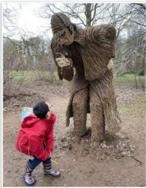
Holmes and Watson