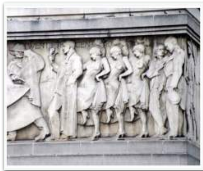
Saville Theatre, Shaftesbury Avenue WC2 (now Odeon, Covent Garden)