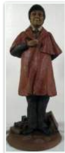
Tom Clark 13" Literary Characters by Cairn Studios