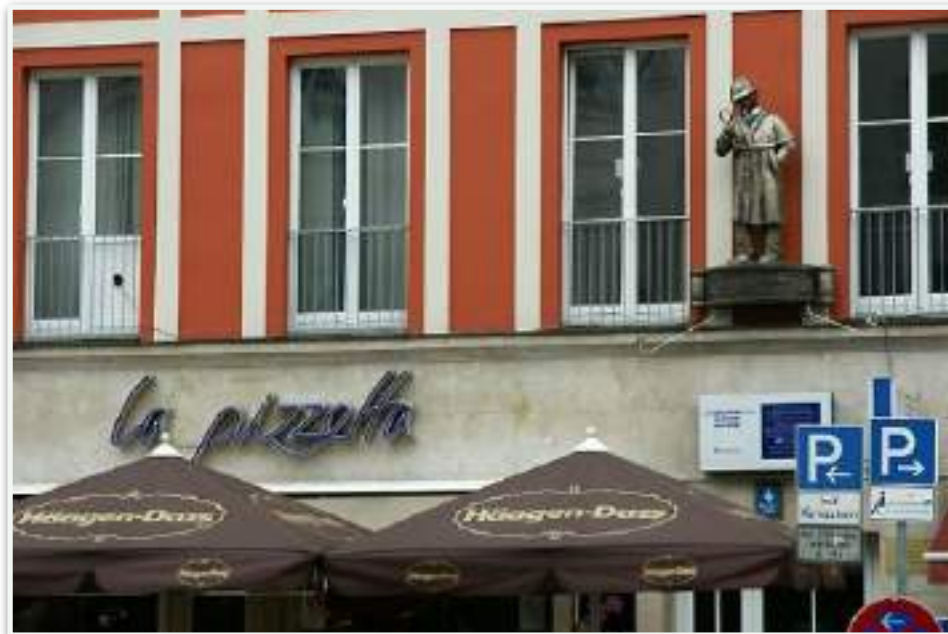
This Sherlock is eyeing himself some Pizza and Ice Cream