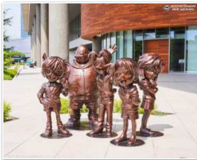
Welcome back, Conan Edogawa - Takarazuka, Japan