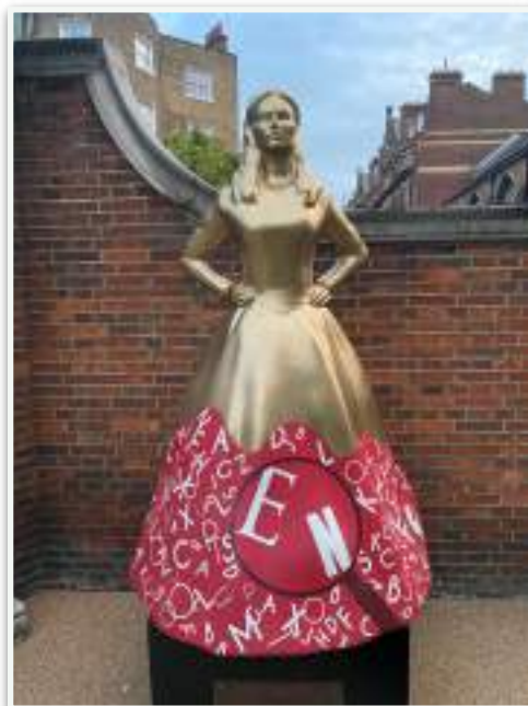
Francis Holland School, Regent's Park