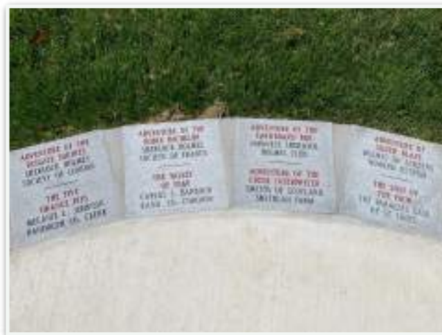
Donor Name/Inscription Pavers