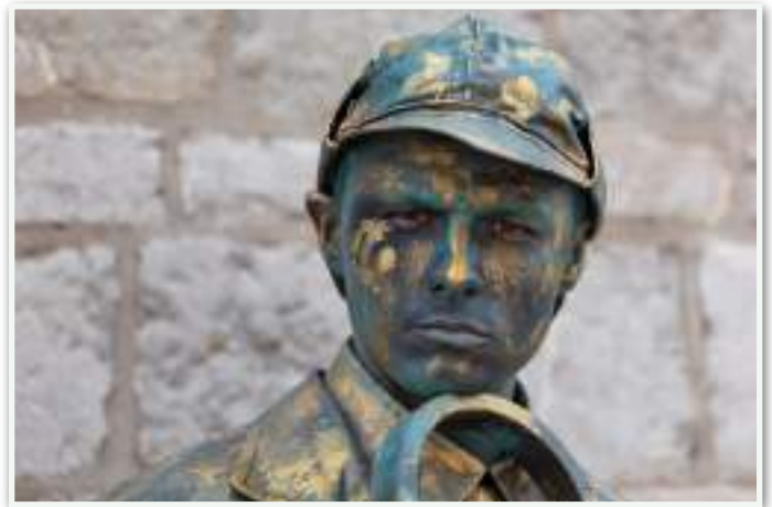
Marche-en-Famenne, Belgium - Statues En Marche Festival (2019)