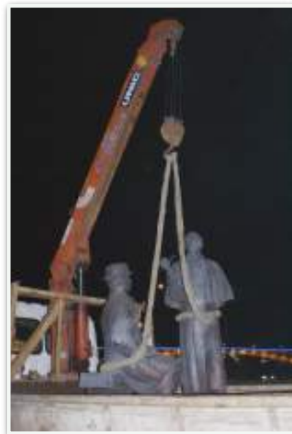
From Workshop to Moscow