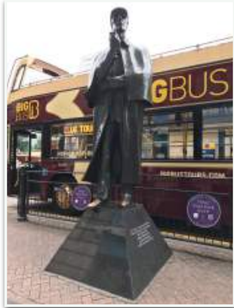
Outside Baker Street tube station on Marylebone Road