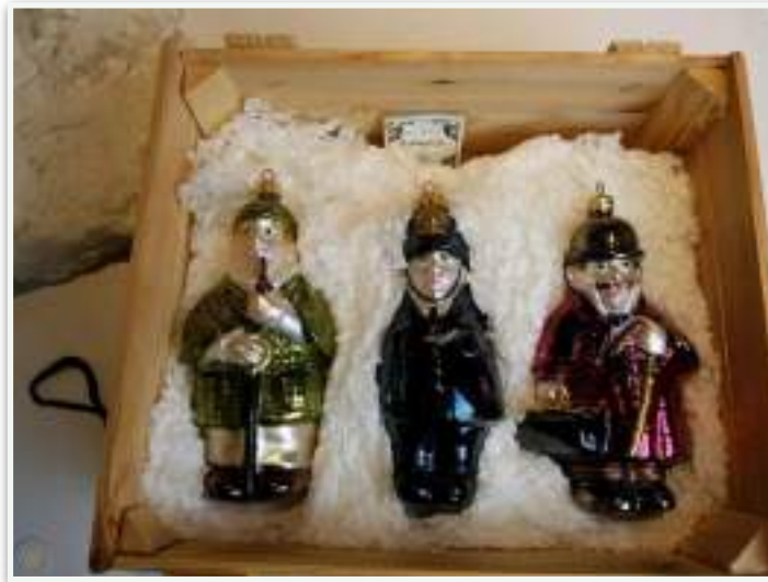
Kurt Adler Polonaise Baker Street Sherlock Holmes Glass Ornaments

Not statues, but by my choices for a colorful beautiful ending.