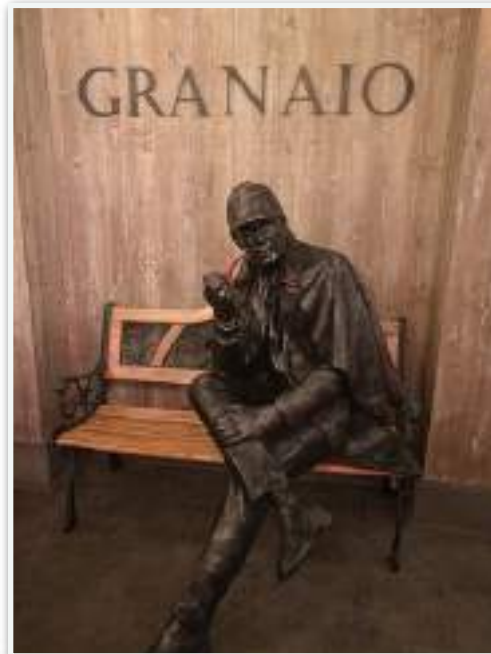
Granaio Piccadilly Italian Restaurant