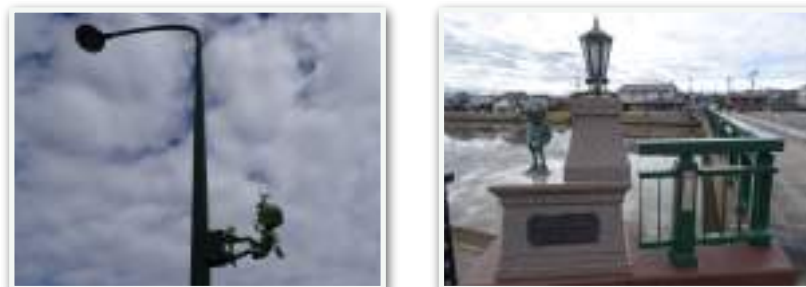
Conan Town, Japan