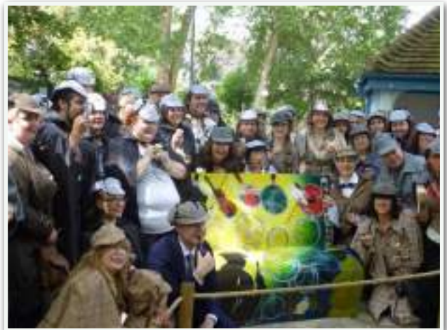
A Gaggle of Holmeses