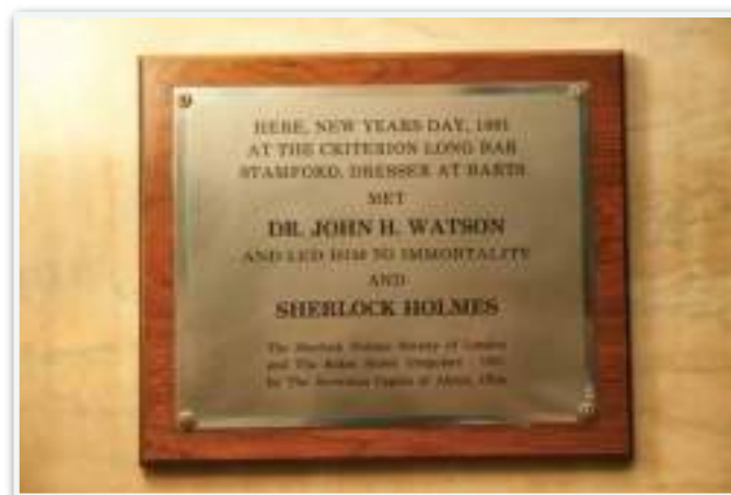
The Commemorative Plaque