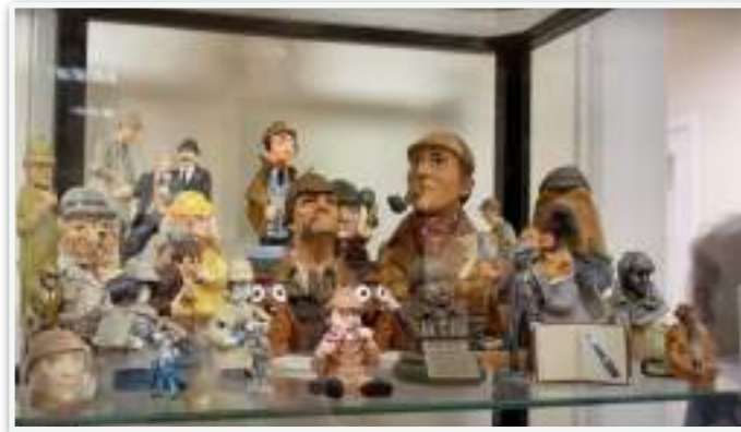
La Biblioteca Pública Arús