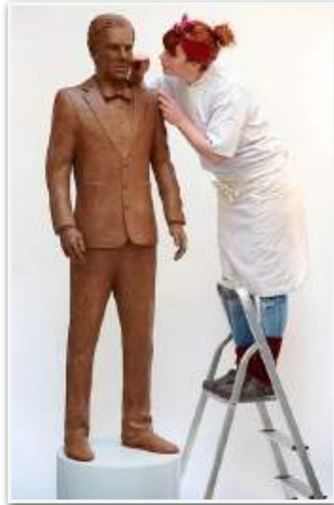
6 Foot Tall

A six-foot chocolate statue has been made in Benedict Cumberbatch's likeness. Perhaps Benedict needs to lay off the chocolates before they can make a season five of "Sherlock".