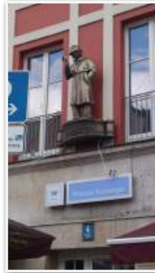
Münchner Detektive Agency, Munich, Germany