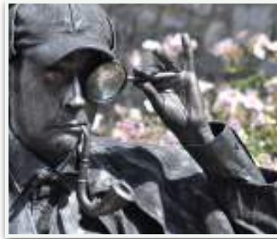
Marche-en-Famenne, Belgium - Statues En Marche Festival (2017)