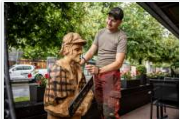
Meiringen's First Sherlock statue observes