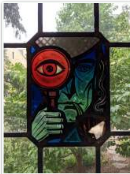
Frey Library, University of St. Thomas, St. Paul, Minnesota

Sherlock Holmes the man who never lived and will never die.