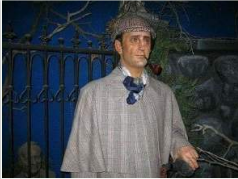
The Movieland Wax Museum, Niagara Falls, Canada.

Many wax museums have a Sherlock Holmes wax figure on display, with Basil Rathbone, Benedict Cumberbatch, and Robert Downey Jr. proving to be quite popular. Here are just a few samples.