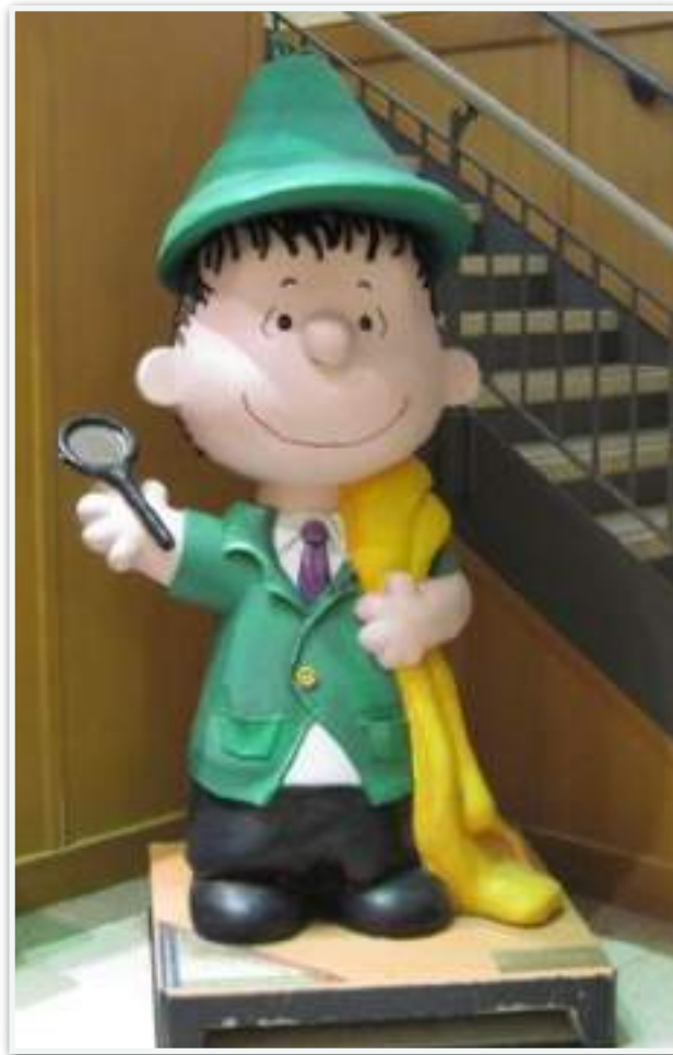
Linus Holmes