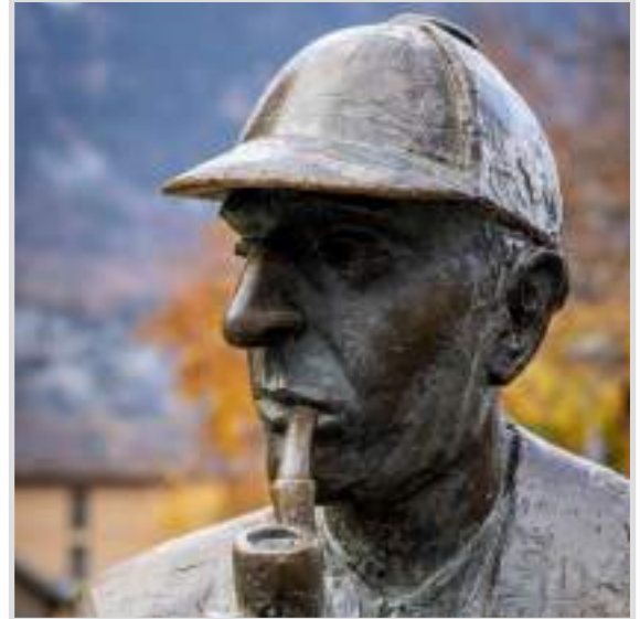
Sherlock Holmes statue - Meiringen, Switzerland