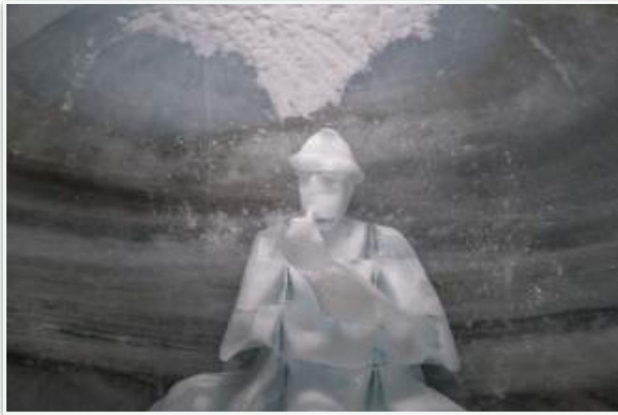
Ice Palace of the Jungfrauoch, Switzerland