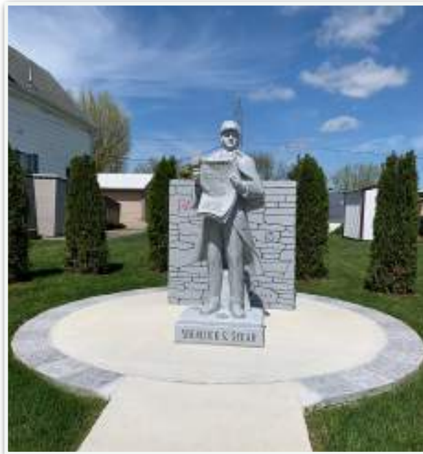
Sherlock & Segar Statue