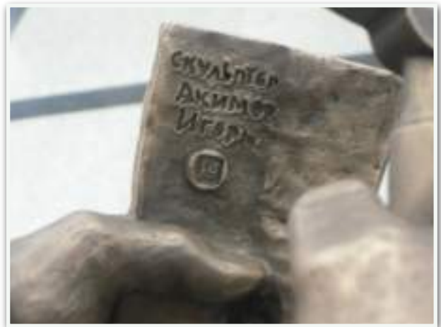
Sculptor Igor Akimov