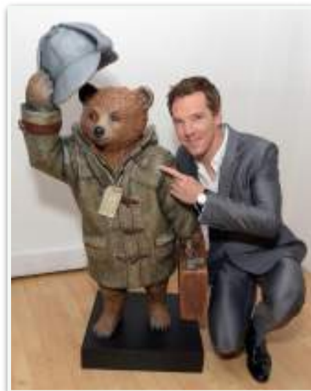
Designed by Benedict Cumberbatch