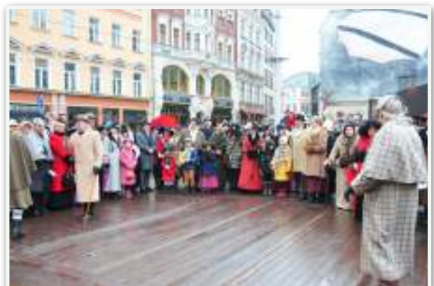
Baker street from Russian Lenfilm Sherlock Holmes films (In reality, Jauniela Street in Riga)