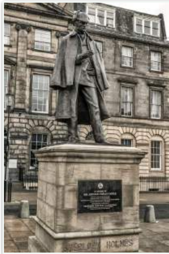
Sherlock Holmes statue - Edinburgh, Scotland