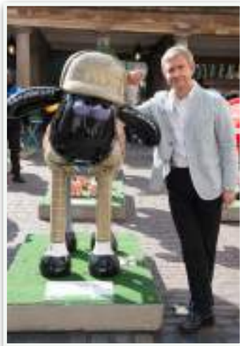
No sheep, Sherlock!