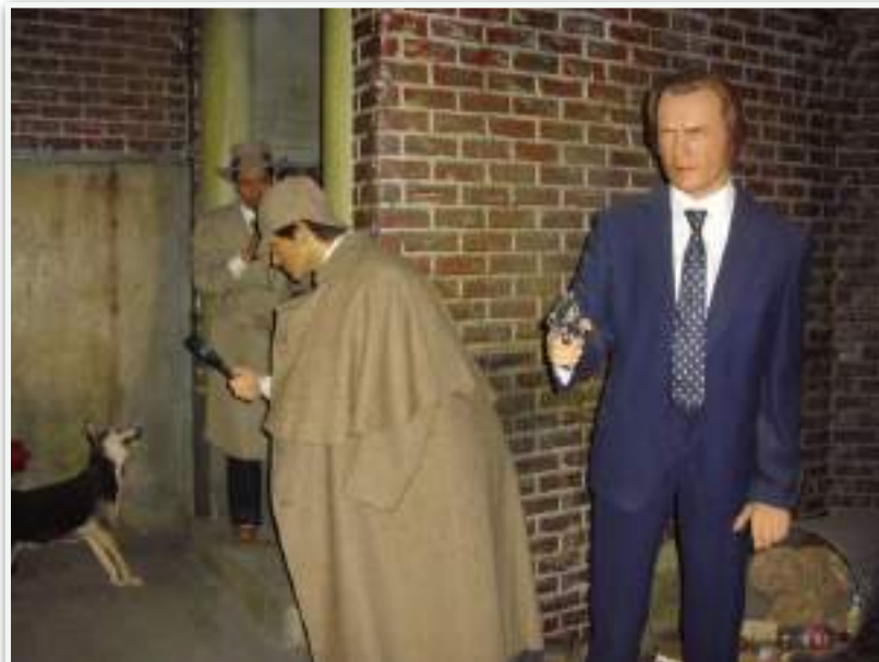
Louis Tussaud's Waxworks , Newport, Oregon