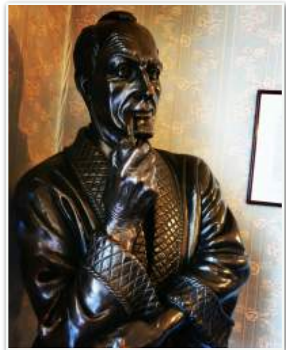
The Sherlock Holmes Museum