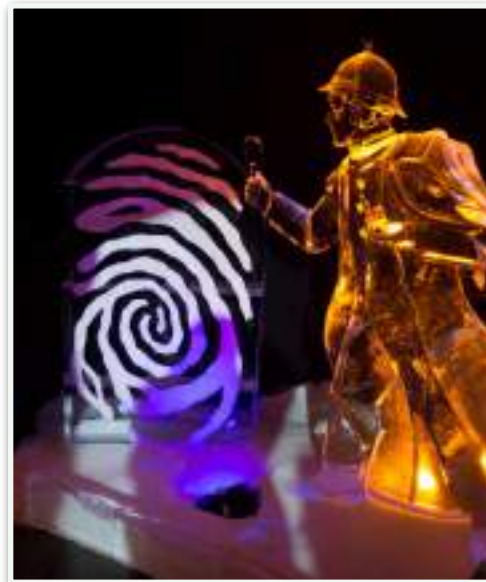
IJsbeelden Festival Zwolle (2018-19)