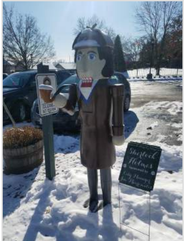
Steubenville Nutcracker Village