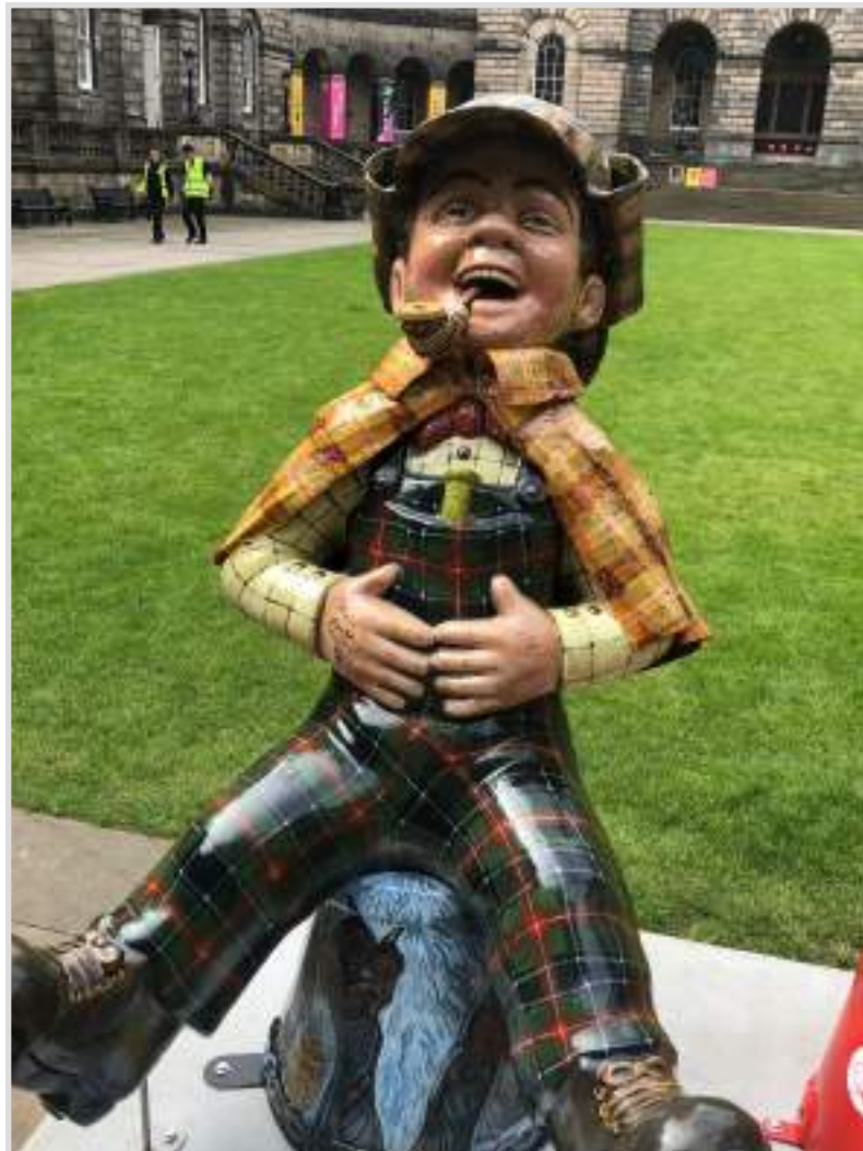
Oor Sherlock Holmes