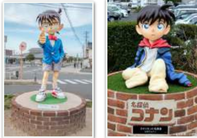
Detective Conan statues

Hokuei is a small town of 15,622 inhabitants in Tottori Prefecture. It is located north of the island of Honshū, facing the Sea of Japan, between Kyoto and Hiroshima. This city is the birthplace of Gōshō Aoyama, the creator Detective Conan. It is now known by the name of Conan Town, and references to Conan are everywhere. A large statue of Conan greets the many Detective Conan fans who visit the town daily. Smaller Detective Conan statues can be found all over town. Recently even, a new Detective Conan statue was been installed next to the flag hoist in front of the Hokuei Town Office. The title is “The Great Detective Turned Small”.