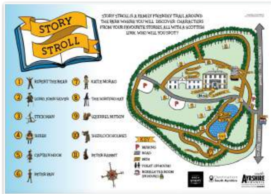
The Story Stroll Map