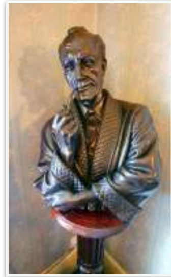
Waxed and Busted!