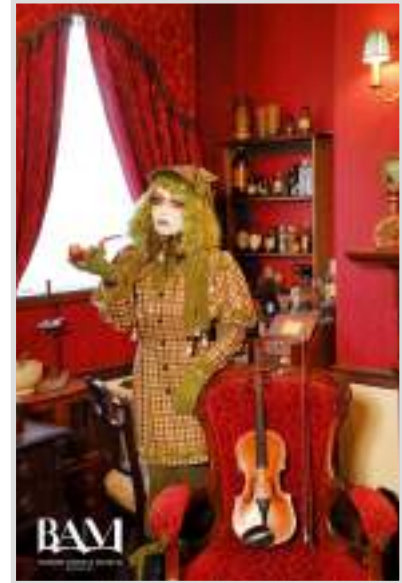
Sherlock Holmes Room