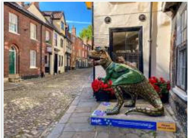
Stoned & Hammered Jewelry Shop 2022