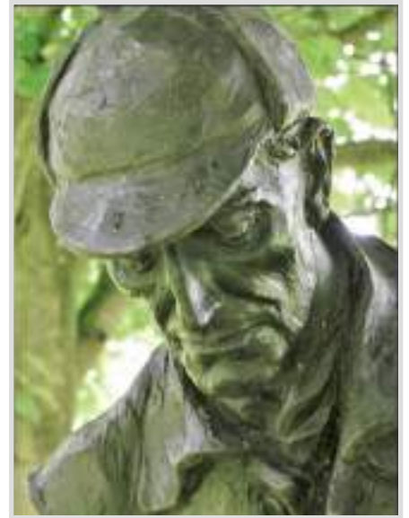
Arthur Conan Doyle (with the Shade of Sherlock Holmes)