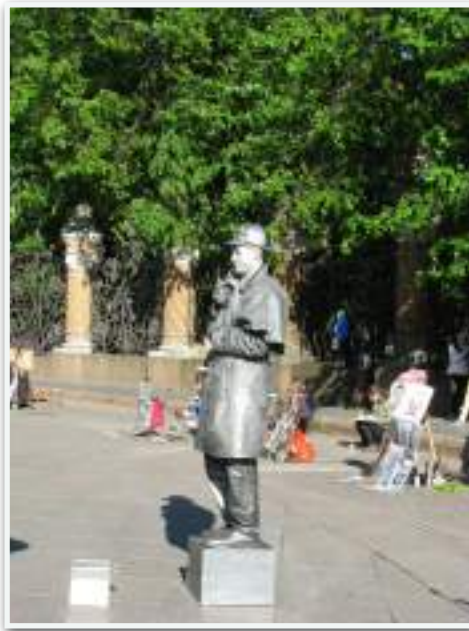
A Living Staute

The Russian people most certainly love Sherlock Holmes. Here are photos of a living Sherlock Holmes statue spotted at a park in St. Petersburg, Russia (2017).