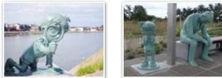
A Magna and Anime Fan’s Dream Town