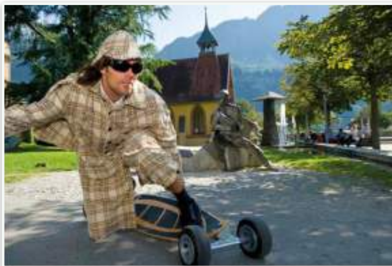
A quicker way to the Reichenbach Falls than a hansom cab