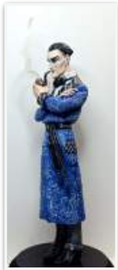
Dellamorte 8" Holmes statue