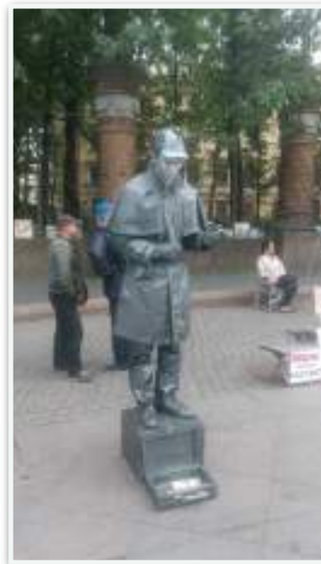
St. Petersburg, Russia (2017)