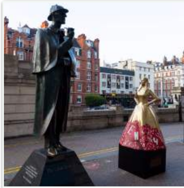
Enola Holmes visits her big brother

Netflix streaming service celebrated the success of their Enola Holmes film, which featured Millie Bobby Brown as Enola Holmes, with Henry Cavill as big brother Sherlock Holmes, by installing statues of historical women across the United Kingdom. The Enola Holmes statue, after a brief visit to her big brother Sherlock on Baker Street, took up permanent residence at the Francis Holland School in Regent's Park.