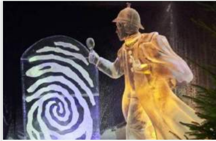
Holmes solving a cold case!

Ice sculpture of the character Sherlock Holmes. Zwolle, Netherlands. Europe's largest ice sculpture festival. Sherlock Holmes at IJsbeelden Festival Zwolle (2018-19).