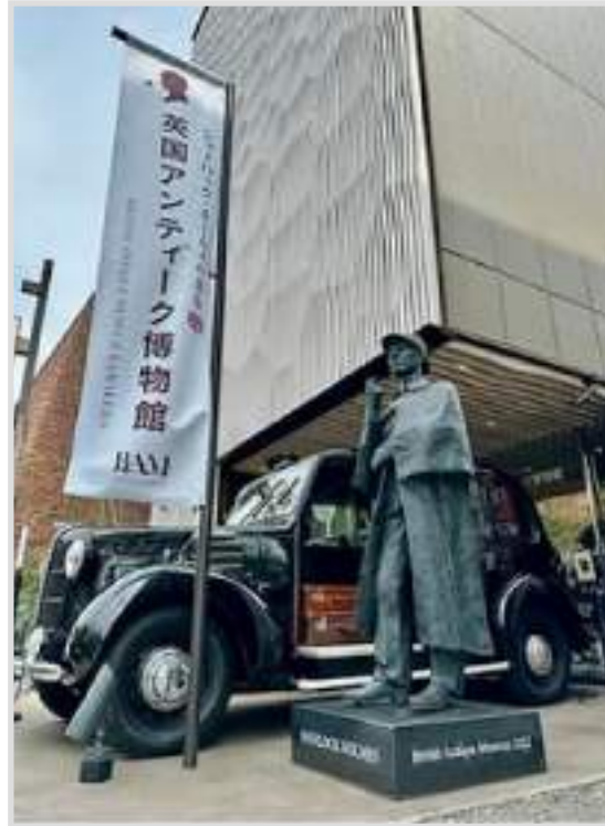
The British Antique Museum

Along side of the London taxi at the entrance to The British Antique Museum in Kamakura, Japan, there now exists a Sherlock Holmes statue marking the one year anniversary of it's September 23rd, 2202 opening.