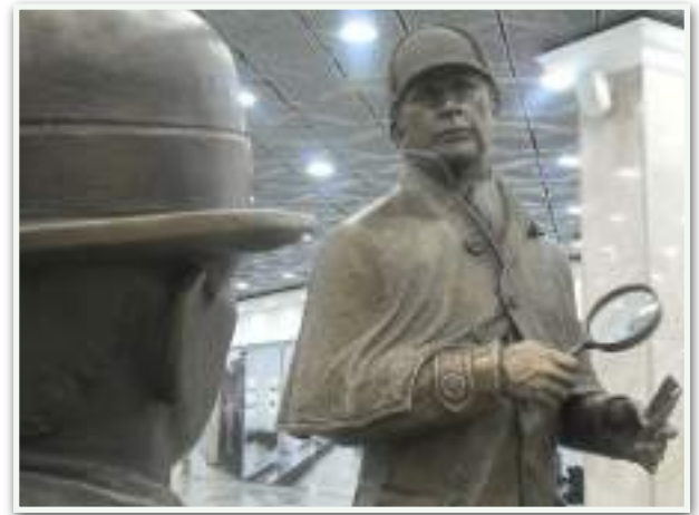
Holmes and Watson in Yekaterinburg, Russia