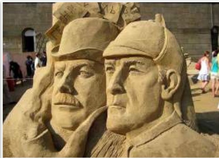
St. Petersburg, Russia

Sherlock Holmes and Dr. Watson sand sculpture at the annual International Festival of Sand Sculpture in St. Petersburg, Russia (2020).