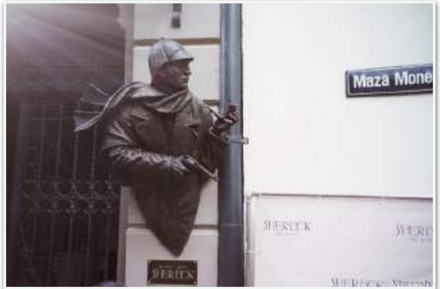
Sherlock Art Hotel - Riga, Latvia