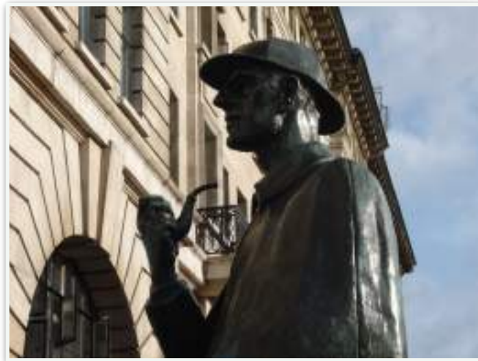
Sherlock Holmes - The Great Detective Statue - London