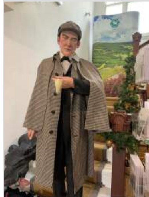
Mr. Holmes have you moved rooms?