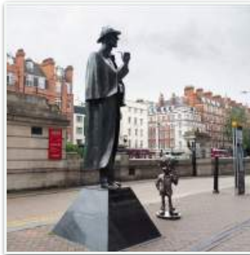
Detective Conan, Conan Edogawa visits Sherlock Holmes

To commemorate the release of the 100th volume of Detective Conan manga, the bronze statue of Conan Edogawa was placed beside the statue of Sherlock Holmes in London, United Kingdom. After being placed beside the statue of Sherlock Holmes, during October 2021, the statue of the little detective is back again at his original home in Takarazuka, Japan, where he quite a tourist attraction.