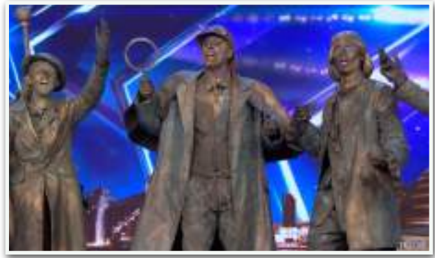
Britain's Got Talent TV Show (2019)