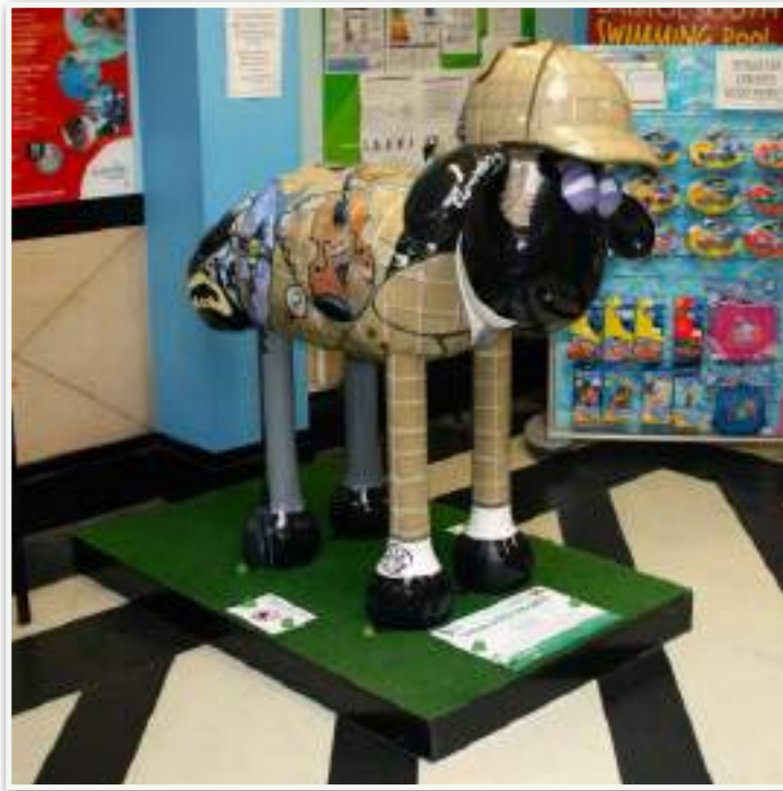
South Bristol Swimming Pool in Bedminster (2015)