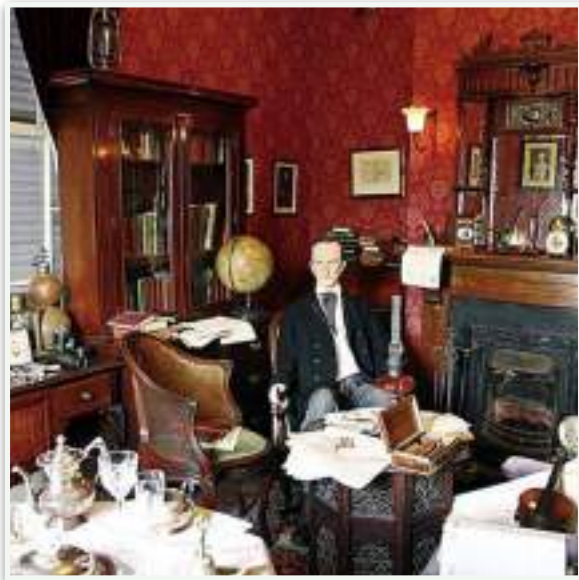
England House, Kobe, Japan