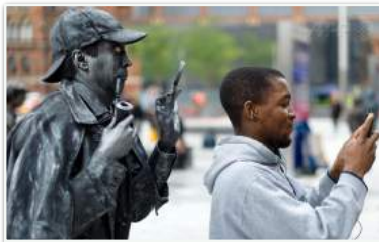
King's Cross Square in London, U.K. (2013)