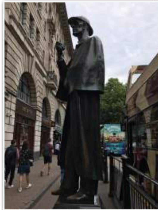
Still keeping an eye on the old neighborhood!

Let us next see how many more Sherlock Holmes statues that follow you've observed or heard of.