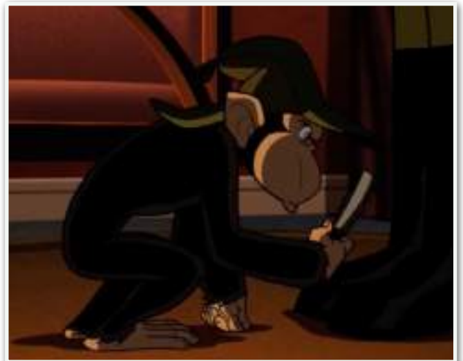
Reminds me more of the animated Sherlock Chimp