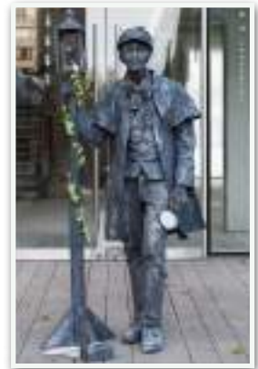
Emmen, Netherlands - Centrum (2017)