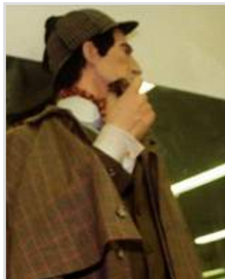
Murder One bookshop