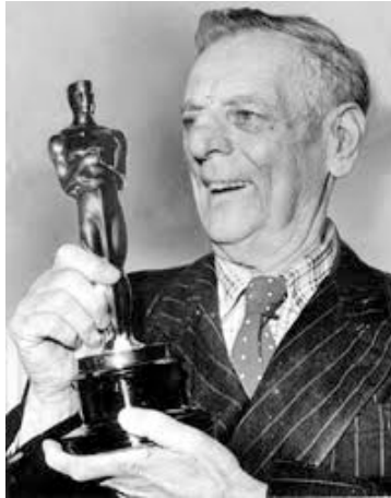
Gilbert M. Anderson

1905 - "Adventures of Sherlock Holmes" (aka "Held for Ransom"), Gilbert M. Anderson as Sherlock Holmes. Vitagraph Film Co.