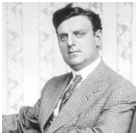
Gilbert M. Anderson

Gilbert M. "Broncho Billy" Anderson was an American actor, writer, film director, and film producer, who is best known as the first star of the Western film genre. It was a long wait for that special Oscar for motion picture pioneer Gilbert M. Anderson, but it was even a longer wait for him to receive the credit as the first Sherlock Holmes of film, see the essay "The Case of the Vitagraph Holmes, (Or, Cowboy in a Deerstalker)" at: http://bakerstreetbabes.com/guest-article-the-case-of-the-vitagraph-holmes-or-cowboy-in-a-deerstalker-by-howard-ostrom/ for more about that.