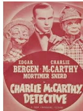
Charlie McCarthy & Edgar Bergan