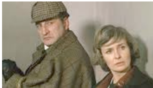
George C. Scott and Joanne Woodward

Joanne Woodard may have won an Oscar for her role in "The Three Faces of Eve", and may be married to Paul Newman, but she is best known in the Sherlockian world for having played Dr. Mildred Watson in the movie "They Might be Giants" (1971). With Oscar winner George C. Scott playing Justin Playfair, the movie plot takes place in a Manhattan psychiatric hospital, where Scott, convinced he is Sherlock Holmes, is treated by a female doctor who happens to be named Watson. A fantastic clip of Joanne Woodward and George C. Scott from "They Might be Giants" can be seen on Youtube at: http://www.youtube.com/watch?v=q2oB0pMWh0Q