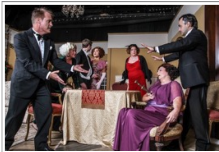
TheGame's Afoot (or Holmes for the Holidays) (2014) (S)