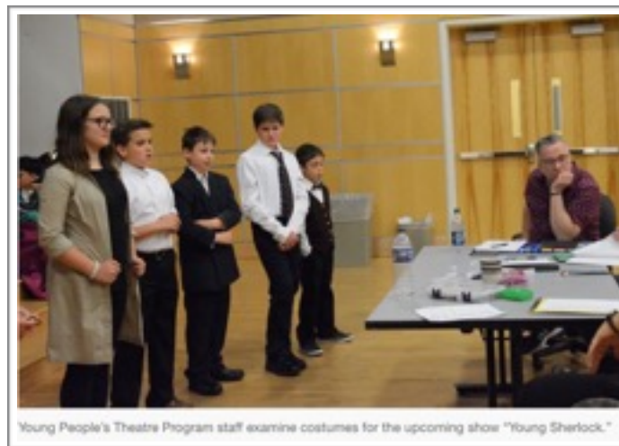
Young People's Theatre Program staff examines costumes for the upcoming show "Young Sherlock."