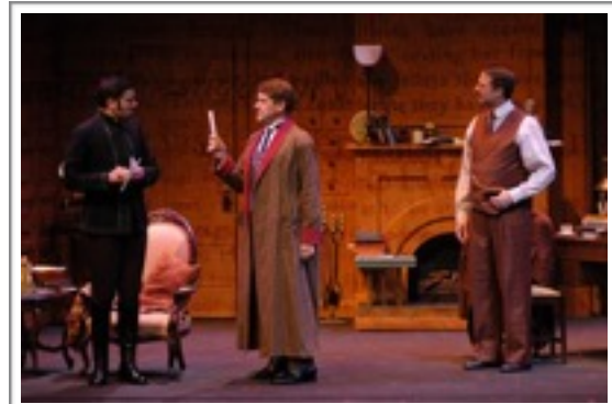
Panto Beauty & The Beast (2003) Sherlock Holmes: The Final Adventure (2015) (S)