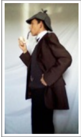
The Thief of Berkley Square (2016) (I) The Thistle Killer (2016) (I)